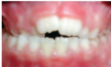
CROSSBITE OF BACK TEETH

Top teeth are to the inside of bottom teeth