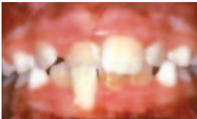
CROSSBITE OF FRONT TEETH

Malocclusions (“bad bites”) like those illustrated below, may benefit from early diagnosis and referral to an orthodontic specialist for a full evaluation.