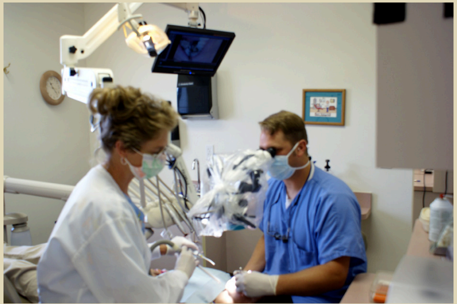
Dr. Ripplinger believes the dental microscope will revolutionize dentistry and will be the standard of care for the future.

The CEREC is an incredible machine that is able to mill out a new crown out of a ceramic block right here in our office. Using traditional methods the patient was fitted with a temporary plastic tooth while the permanent