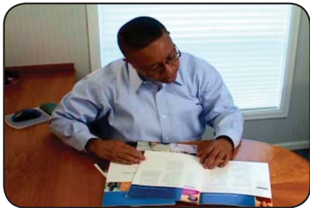
Thoroughly read insurance plans

Even though most plans pay only for basic services, we believe that you should be able to choose the most appropriate dental treatment for you and your family.