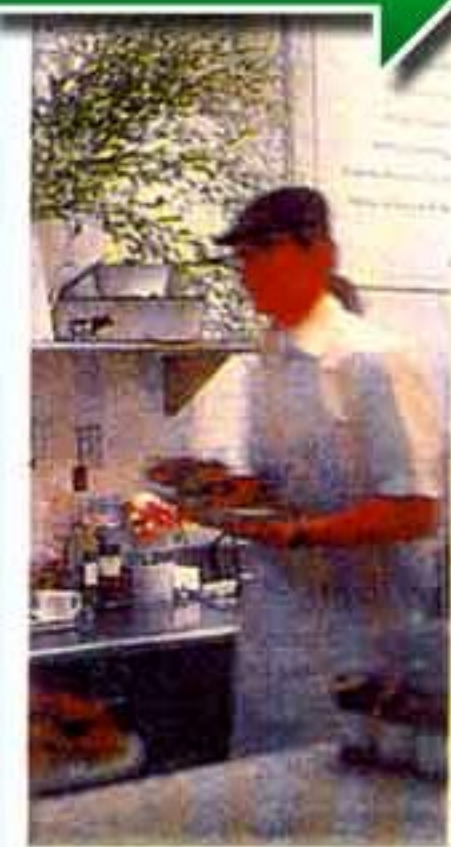
< The bustle at Joan's