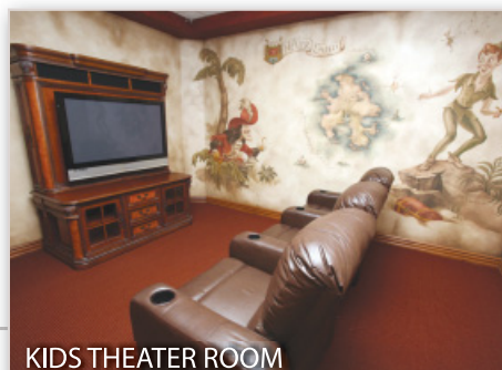
KIDS THEATER ROOM

Invisalign® • Childrens Dental • Smile Makeovers • Sedation Dentistry Whitening • Dental Implants • Porcelain Veneers • DIAGNOdent® Diagnostic Laser Cleanings & Preventive Care • Complete Family Dentistry • 20 Years Experience