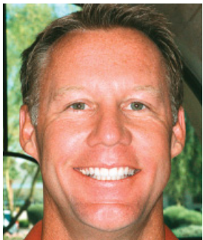
ACTUAL PATIENT AFTER INVISALIGN™

A: No, the aligners need to be removed when eating, drinking (especially hot liquids), and when doing your daily oral hygiene. They may also be removed at other times when you feel it is necessary, but remember: to have the best chance of success with any type of orthodontics patient compliance is necessary. So the more you wear them the better chance you have for a successful outcome. Typically 20-22 hours of wear per day is a good "rule of thumb" for success.