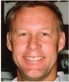
ACTUAL PATIENT BEFORE INVISALIGN™

A: Not so strangely, this is the most frequent question I am asked about Invisalign. Many people just don't believe they would be a candidate for Invisalign either because they think they are too old for any type of orthodontics or because their teeth are too rotated/crooked or they only need a minor amount of correction. In actuality over 85% of the adult population could be treated using Invisalign. This is a very exciting figure when you consider the advantages of Invisalign when compared to traditional orthodontics.