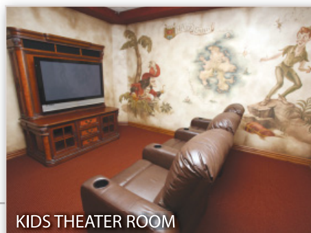
KIDS THEATER ROOM

Invisalign® • Childrens Dental • Smile Makeovers • Sedation Dentistry Whitening • Dental Implants • Porcelain Veneers • DIAGNOdent® Diagnostic Laser Cleanings & Preventive Care • Complete Family Dentistry • 20 Years Experience